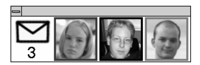
Fig. 1. The "Gallery"

Each co-worker is identified by a unique color in the gallery which is used to draw the border of his or her image. This color is used to identify screen elements locked by different users working on the same record.